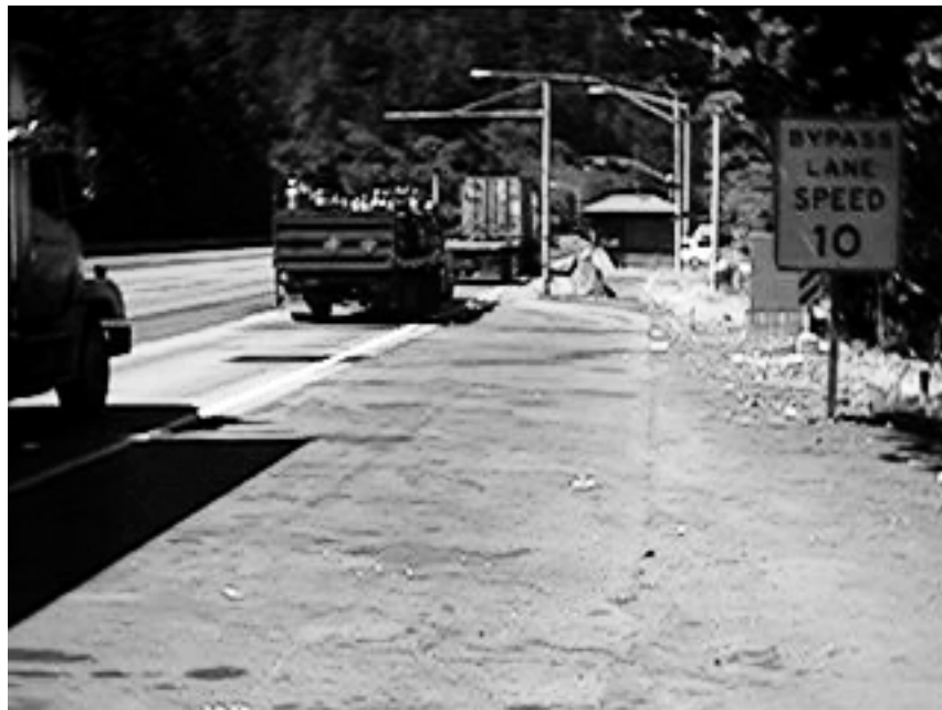
FIGURE 5 WYETH FACILITY AND WIM SYSTEM

weight recorded by the WIM scale is displayed in a monitor in the station house. For a vehicle traveling at 5 mph, about 15 seconds elapses between the WIM and static scale locations. In normal operation, the large volume of traffic has led to allowing trucks to pass over the static scale at a slow roll, and under these conditions the WIM scale has served effectively as a screening device in weight enforcement.