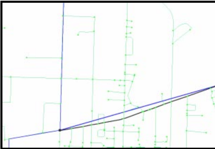
Figure 1 basic arterial concatenation

Much of Clackamas and the Canby study area can be described as rural in nature, with a corresponding rural road network. One characteristic of a rural road network is the much lower road and intersection density. It is also highly unlikely to be a traffic assignment network such as that found in the Portland area. For these reasons, for the rural parts of the study area would normally be assigned an arterial roads code that is the concatenation of the Oregon and Clackamas County FIPS codes and Oregon or Clackamas DOT road ID. Many of these rural roads, however, were within the boundaries of Portland Metro, which desired a finer segmentation.